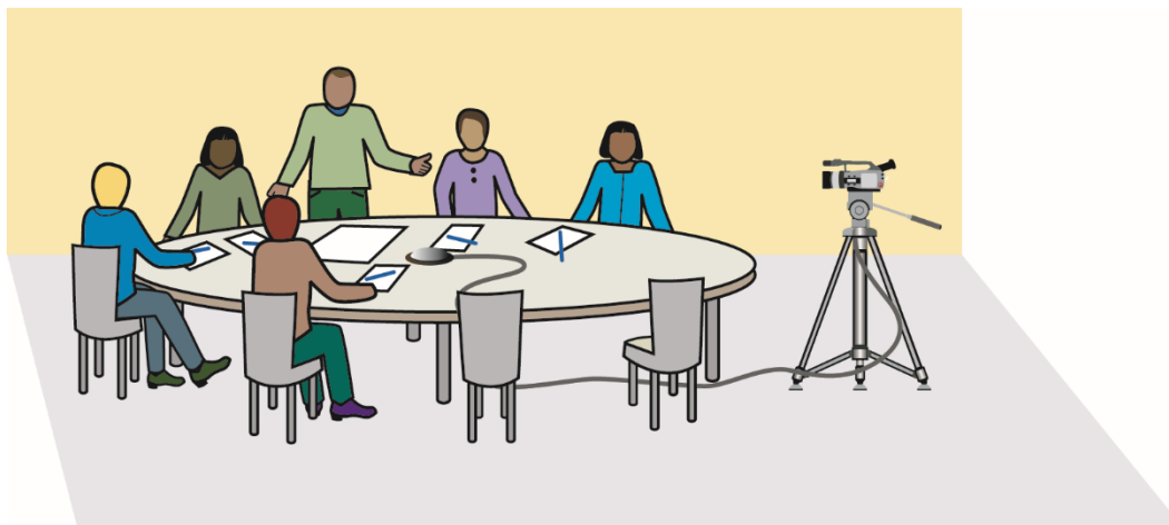
View of a small group showing best camera and microphone placement