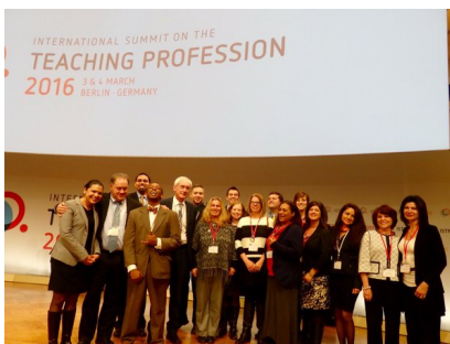
U.S. Delegation at International Summit on the Teaching Profession

Washington, DC to network and engage with other educators from around the country, receive a series of trainings on how to elevate their own experiences and stories, and discuss policies addressing each aspect of the teacher career continuum.