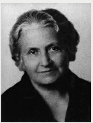
ori was the first woman to enter medical school in Italy teaching license, she was not 1896. Montessori advocated for better Charleston, South Carolina for the support of developmentally disabled children and studied education philosophy extensively. Today, her legacy lives on in the Montessori Method of education and the many schools she inspired that still exist.